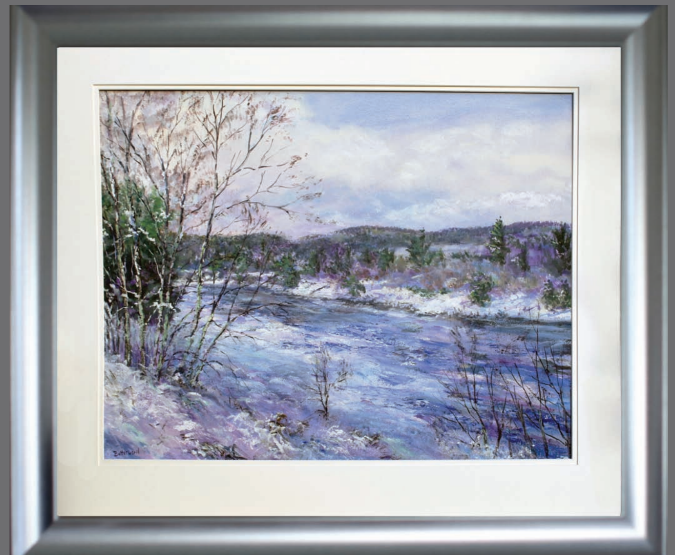
You will be following in royal footsteps if you own Crystal.