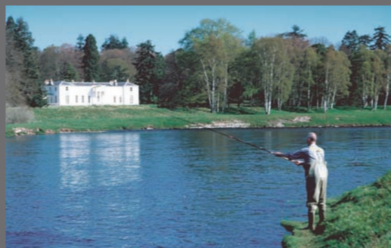
Park is a 'big fish' beat