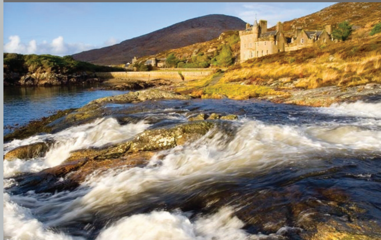
The prestigious Amhuinnsuidhe Castle, North Harris Estate