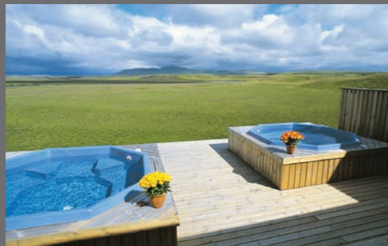
East Ranga River has been one of the most prolific salmon rivers in Iceland